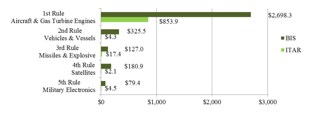
U.S. Exports of 600-Series and 9x515 Items Under BIS and DDTC Jurisdictions October 15, 2013 to June 30, 2015 $million