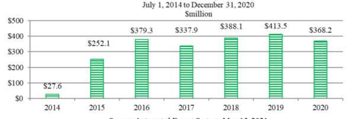
U.S. Yearly Exports under the Third USML to CCL Regulatory Change under BIS Jurisdiction Missiles and Explosives