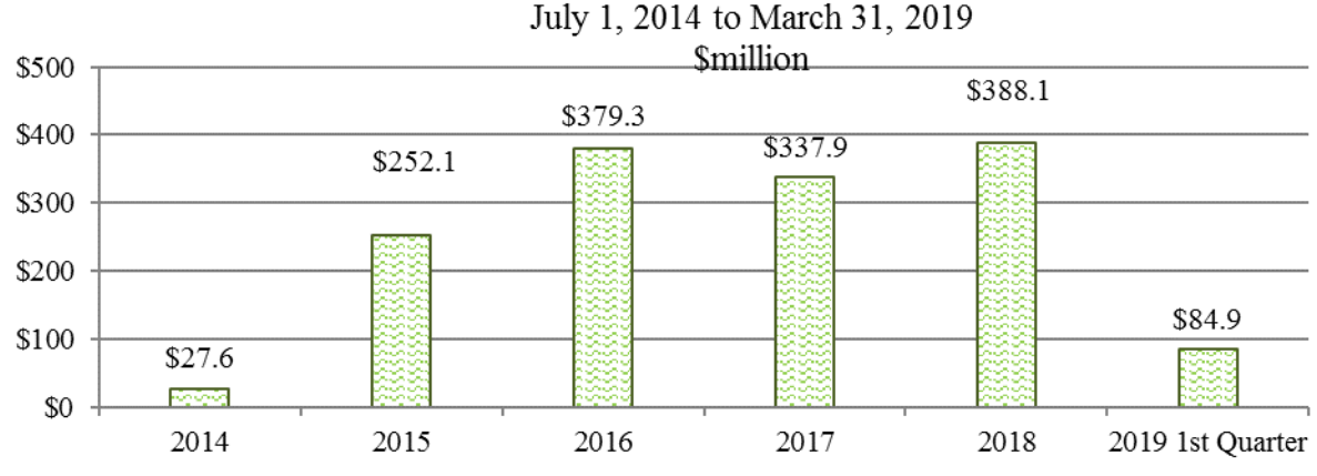
U.S. Yearly Exports under the Third USML to CCL Regulatory Change under BIS Jurisdiction

From July 1, 2014 to March 31, 2019, U.S. exports of items in the third USML to CCL regulatory change – Missiles and Explosives items (0y604, 0y614, 1y608 and 1y613) under BIS jurisdiction totaled 24,215 shipments for $1.5 billion.