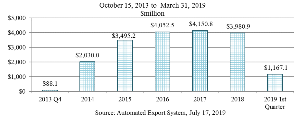
U.S. Yearly Exports under the First USML to CCL Regulatory Change under BIS Jurisdiction

From October 15, 2013 to March 31, 2019, U.S. exports of items under the first USML to CCL regulatory change – Aircraft and Gas Turbine Engines items (9x610 and 9y619) under BIS jurisdiction totaled 354,569 shipments for $19.0 billion.